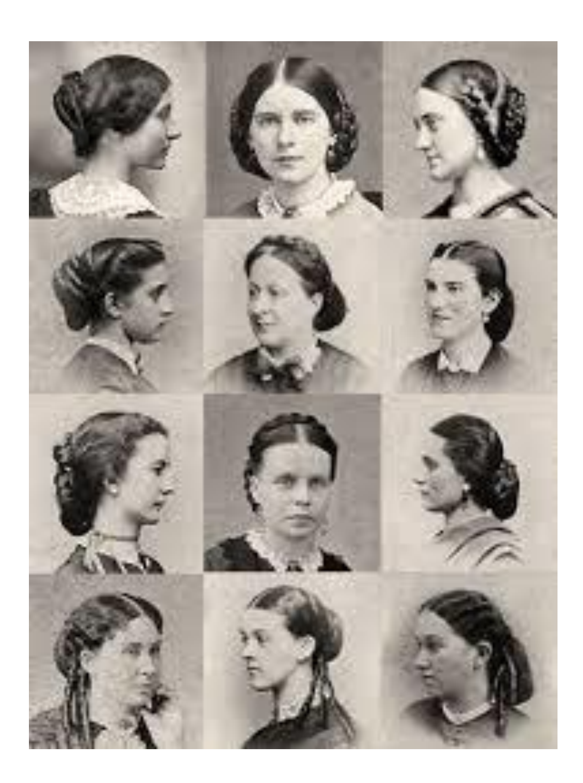
Illustration of Sample Hair Styles of the 1860s

Civilian_Handbook - Volumn 1- Edition 8 - 011818.docx